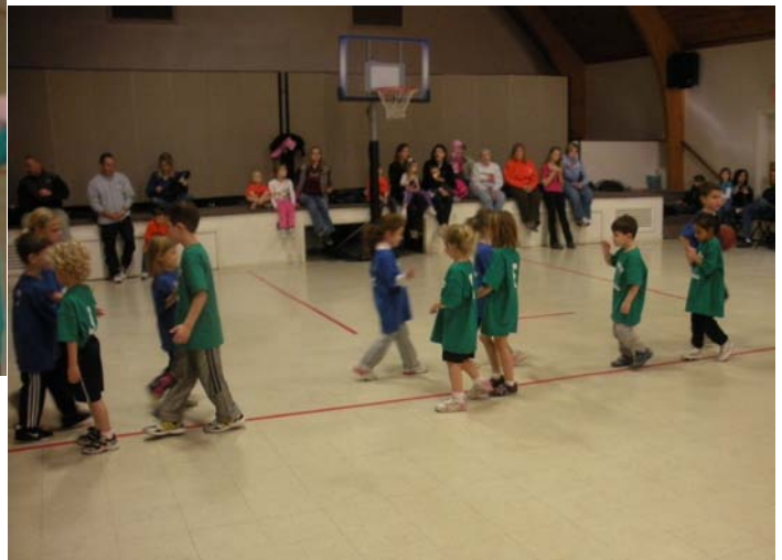
Below: Handshake after the game.