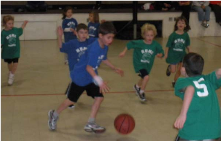
Above: The blue and green teams play.